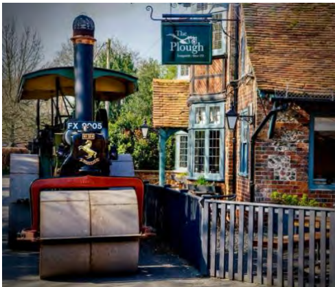
Photo: Steam engine outside the Plough

On Saturday it was as if we'd woken up in another era: we were visited by a series of beautiful old steam engines which stopped at The Plough for breakfast in the morning as they passed through Longparish, then dropped in again in the afternoon so the drivers and their teams could take some refreshment in the sun. At one point, and by contrast, the old engines were joined by a beautiful, vintage Rolls Royce, when its owner stopped and popped into The Plough for a quick glass of lemonade.