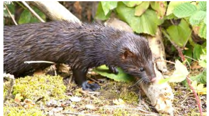
American mink

This impact is a top cause of worldwide biodiversity loss, and costs our economy £1.7 billion each year. Our precious chalk streams - globally rare havens for many endangered species - are badly affected by invasives like Himalayan balsam, American mink, and signal crayfish.