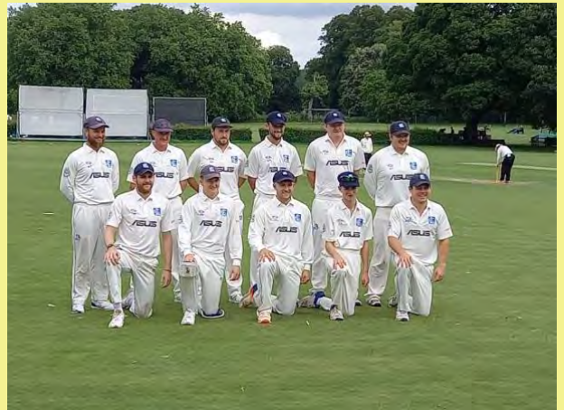
Longparish 1 st XI(2021)

The club runs three senior teams playing league cricket on Saturdays, as well as midweek 20:20 team and Sunday friendly team. We also run junior teams at U11, U13 and U15 age groups, who compete in the local junior cricket leagues. New for this year is All Stars cricket for school years 1-3 which is one hour a week of cricket fun for boys & girls. The first session is on Monday 9 May 2022 at 5pm. Further details, including the enrolment process, can be found via this link to the central on-line portal: https://www.ecb.co.uk/play/all-stars